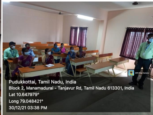
Dr.D.Sivakumar delivered the lecture